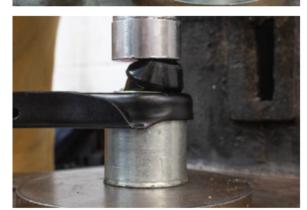
Figure 3. Bush pressed at an angle.